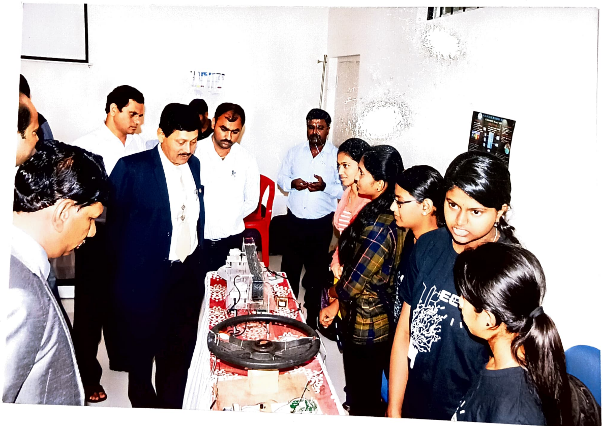
STATE LEVEL EXHIBITION-2017 PRESENTED BY THE STUDENTS