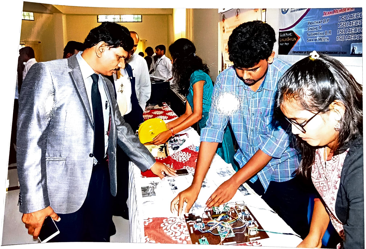
STATE LEVEL PROJECT EXHIBITION CONDUCTED BY COMPUTER SCIENCE DEPARTMENT IN AIT