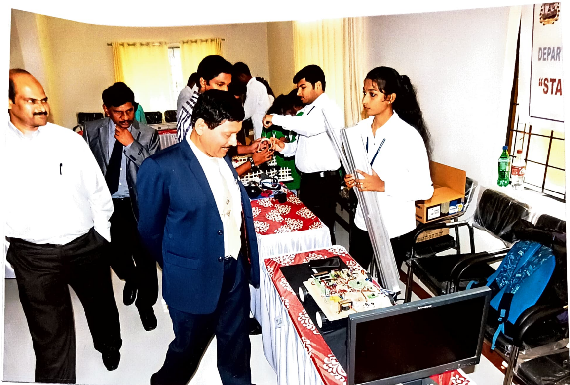
STATE LEVEL PROJECT EXHIBITION PRESENTED BY THE PARTICIPANTS